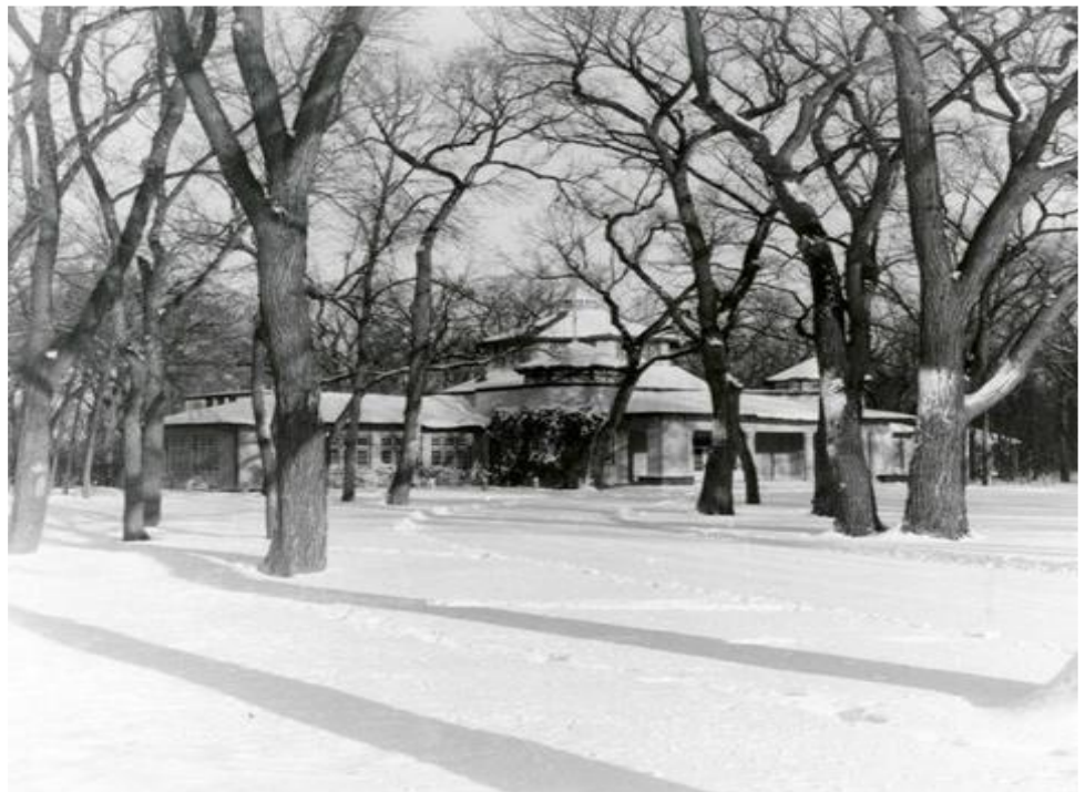
Old Kildonan Park Pavillion in Winter

https://winnipeginfofocus.winnipeg.ca/i03486