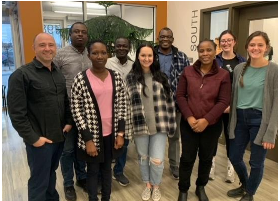
New SOTA Members at the Fall Reception